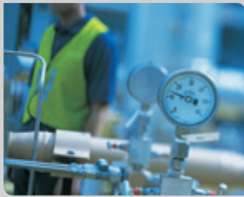
Field Force Automation