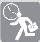
Work Order Tracking