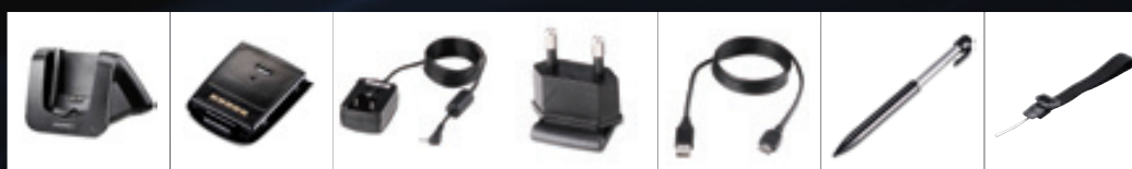
Cradle Battery Adapter Plug Adapter USB Cable Stylus Pen Wrist Strap