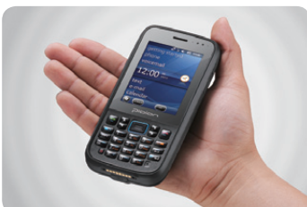
The Smallest, The Lightest