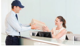
Transportation & Logistics