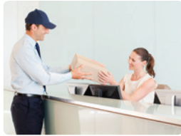
Transportation &amp; Logistics