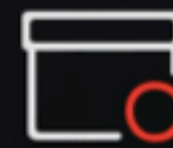
Shipping/ Truck Loading