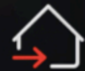
Picking and storage