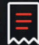
Sales/ order tracking