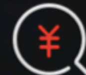
Price verification/ update