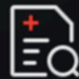
Inquire patients' information